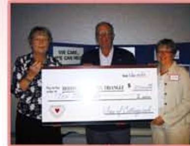
Town of Collingwood Presentation