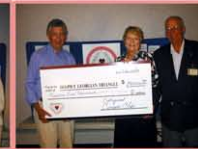
Cinema Club Presentation