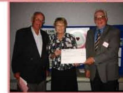
Independent order of Oddfellows Presentation