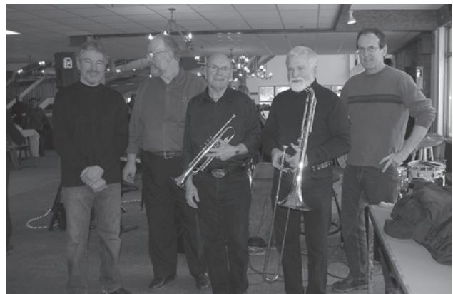
The EH Train livens up the clubhouse for the skiers and snowshoers.