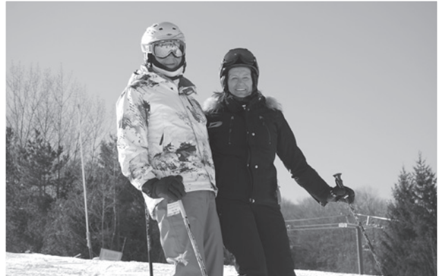
Ready to schuss the hills for hospice.